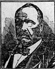
Prof. A. S. Arrhenius.

Prof. Arrhenius, Famous Swedish Chemist, Coming to America. Prof. August Svante Arrhenius, who has just announced important discoveries in regard to the sun's corona, is a famous Swedish chemist, and is in this country on invitation from several universities to deliver a series of addresses. Dr. Arrhenius is a professor in the University of Stockholm, and last year was elected as one of