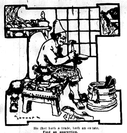
He that hath a trade, hath an estate. Find an apprentice.

reported from Alabama, Georgia and Florida. In Texas the early planted is reported as promising.