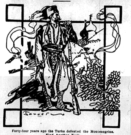
Forty-four years ago the Turks defeated the Montenegrins. Find Anrka Turk.