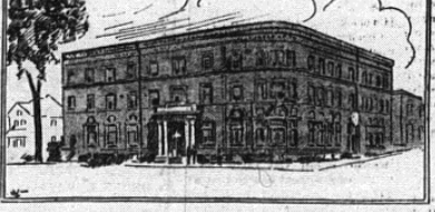
Y. M. C. A. BUILDING TO BE ERECTED AT BLOOMINGTON.

Firebug Wipes Out Town. Marion—Information has reached this city of a fire which almost wiped the little village of Gorvville, in Jackson county, from the map. Out of 25 business houses but seven are now standing.