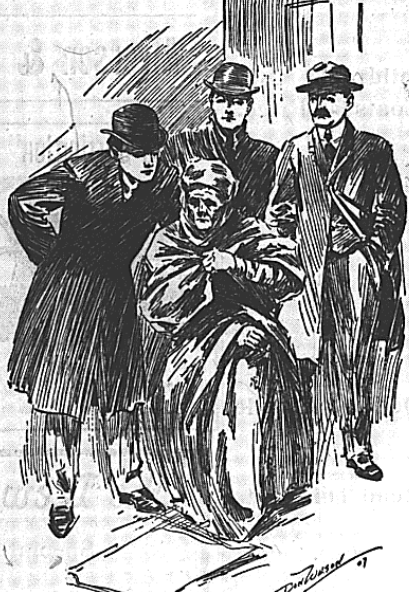
"MOTHER BORTON SULLENLY TOOK A CHAIR"

slightest emphasis on the words, "to accompany the party, I shouldn't think it would be necessary for me to go."