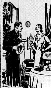
"But Her's White Clean Through, for All That, Believe Me!"

because they've got a couple too many drinks inside of them and are talking to some skirt they wouldn't introduce to their mother—I guess these old cabbages and judges and governors would think the good old stock had run down to a pretty poor line of goods!