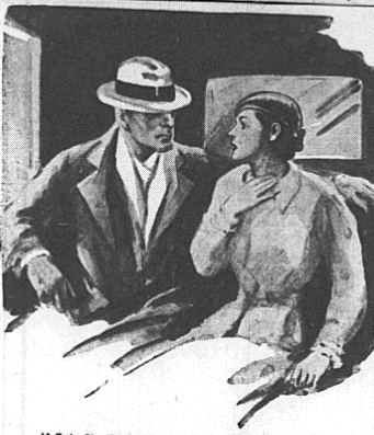
If Only She Could Get Away From This Horrible Man.

Just one of the many exciting situations in "TANGLED WIVES" which is appearing serially in The Review. The first three installments are reprinted on the following page so that you may start reading it now.