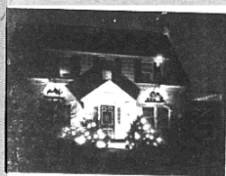
The owner of this home used cleverly placed floodlights and silhouette cutouts of Christmas figures, supplemented by beautifully trimmed evergreens at the entrance.

Making the home a shining example of holiday good-will by attractive Christmas lighting decorations has become "just an old American custom". Here are some practical illustrations of what can be done.