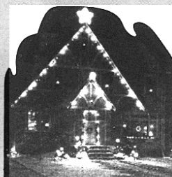
This picture shows how festoons of lights can be used to emphasize the important lines of the house. Indoor decorations in or near the windows add interest.