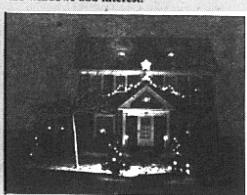
Candle forms at the entrance can be made of painted tubes of tin or cardboard and a flame-colored lamp. In addition, homes like this with light toned trim are made distinctive with simple floodlighting.