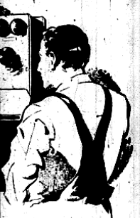
plement Paid its Own Way... brings knowledge of markets and prices, and in a year's time the EXTRA profits and savings that are made because of it should more than pay for telephone service...