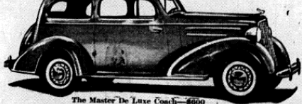
The Master De Luxe Coach—$560

AND UP. List price of New Standard Roadster at Plant, Mich., $465. With bumper, spare tire and tire lock, the list price is $50.00 additional. Price quoted in this advertisement are list at Plant and are subject to change without notice.